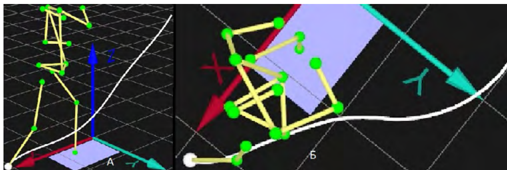
Fig. 1. The trajectory of the kicking biolink when performing a right-side kick from front stance in the kicking phase (a – side view, b – top view)

The average speed of the right ankle joint during the kicking phase is 5.72 \text{ m}\cdot\text{s}^{-1} .